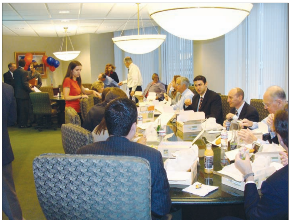
Woods Oviatt Gilman LLP attorneys enjoy boxed lunches during a Pro Bono Idol event.