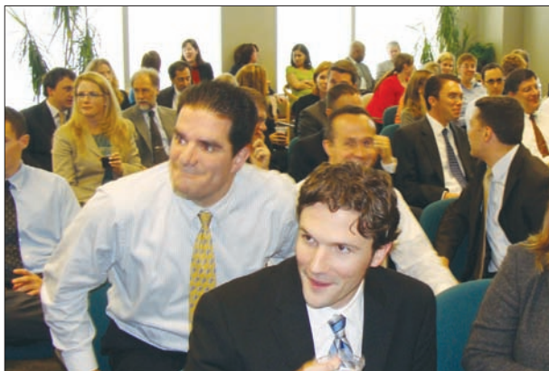
Harter Secrest & Emery LLP attorneys pack a room to hear Pro Bono Idol presentations during national Pro Bono Week, Oct. 25-31.